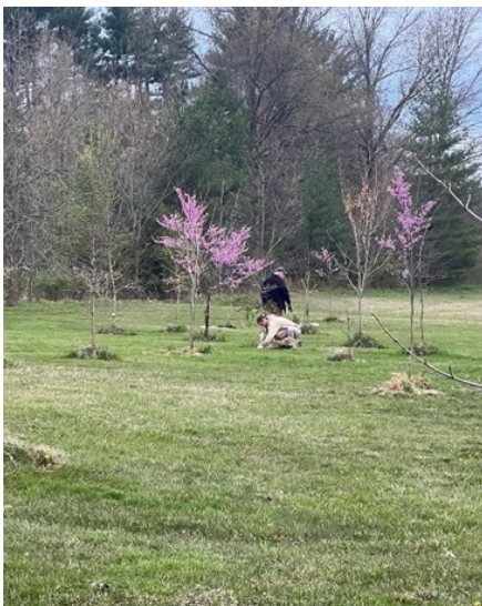
Robert's Mill Park - Tree planting maintenance