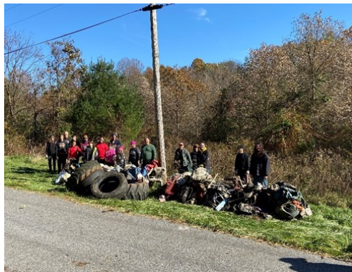
← Little Pipe Creek Stream Cleanup

If you are interested in promoting the enhancement of natural resources within the Monocacy River Watershed, the Board is looking for volunteers who are willing to serve and participate. For additional information contact Byron Madigan at 410-386-2167.