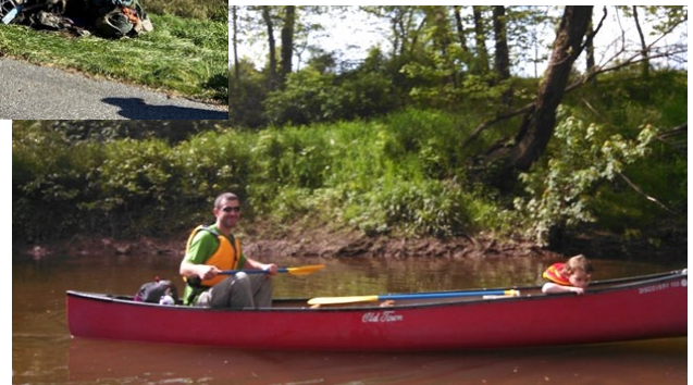
Monocacy Board Float Trip ↓