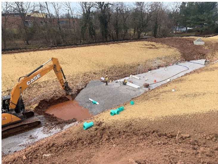
Trevanion Terrace Underdrain